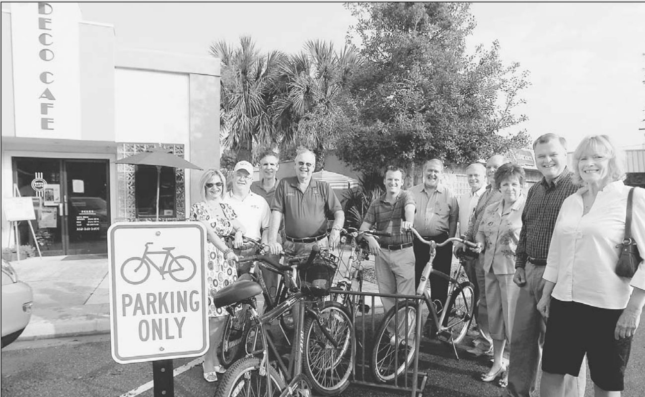
City of Inverness staff members, downtown merchants, city council representatives and community members gather outside of the Deco Café on Courthouse Square recently to unveil a new bicycle parking area. The city will designate one parking space near the café solely for bicycle parking.

Those who believe cycling is an economic benefit to the area range from city planners to bicycle shop owners to biking enthusiasts. As the numbers of people riding the Withlacoochee State Trail continues to grow, plans are being formulated to capitalize on appeal of Citrus County as a bicyclist's destination.